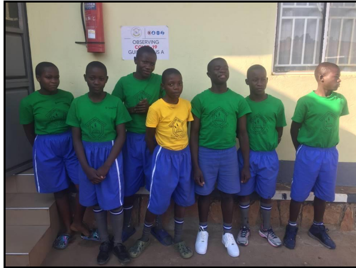
Ugandan Lambs supported children pose for a photo at St. Kizito Primary school.